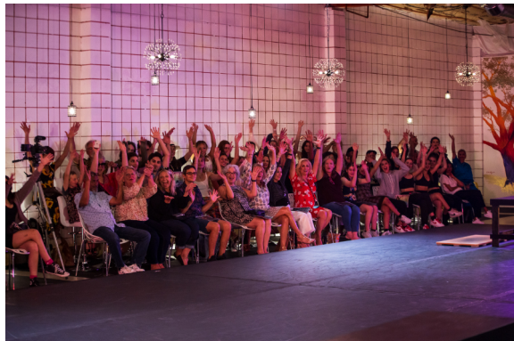
Photo featuring Rangoli Dance Company