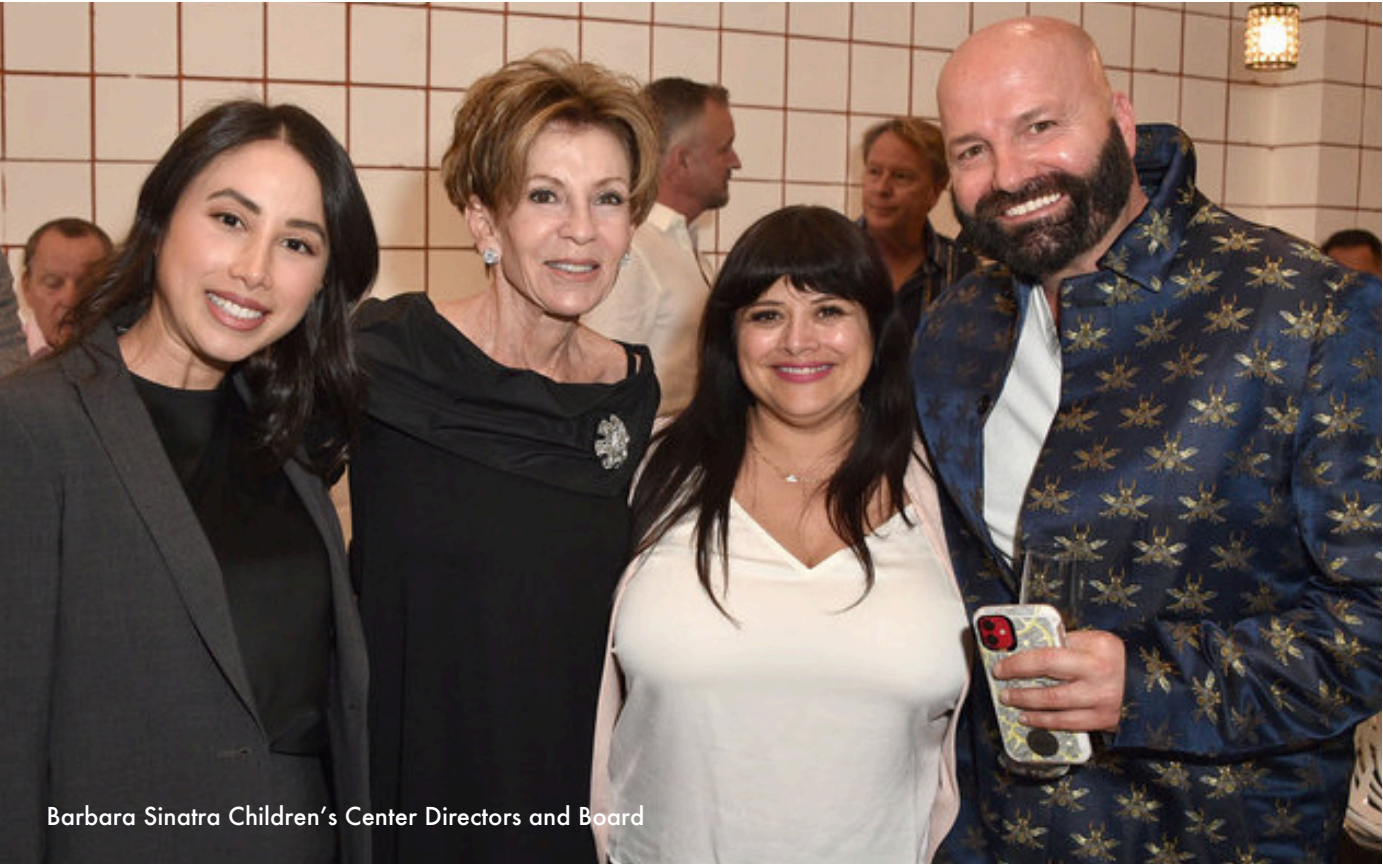
Barbara Sinatra Children's Center Directors and Board